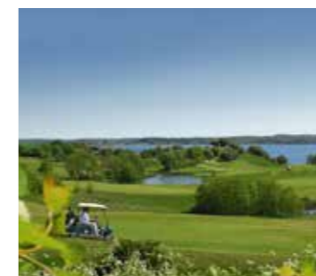
Benniksgaard Golfbane 2 km.