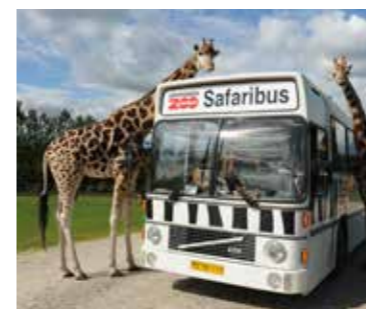
Givskud Zoo 120 km.