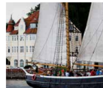
Sønderborg 20 km. Flensborg 22 km