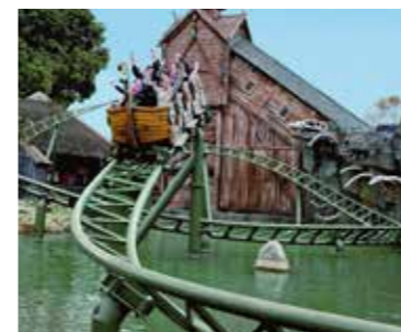
Hansa Park 169 km.