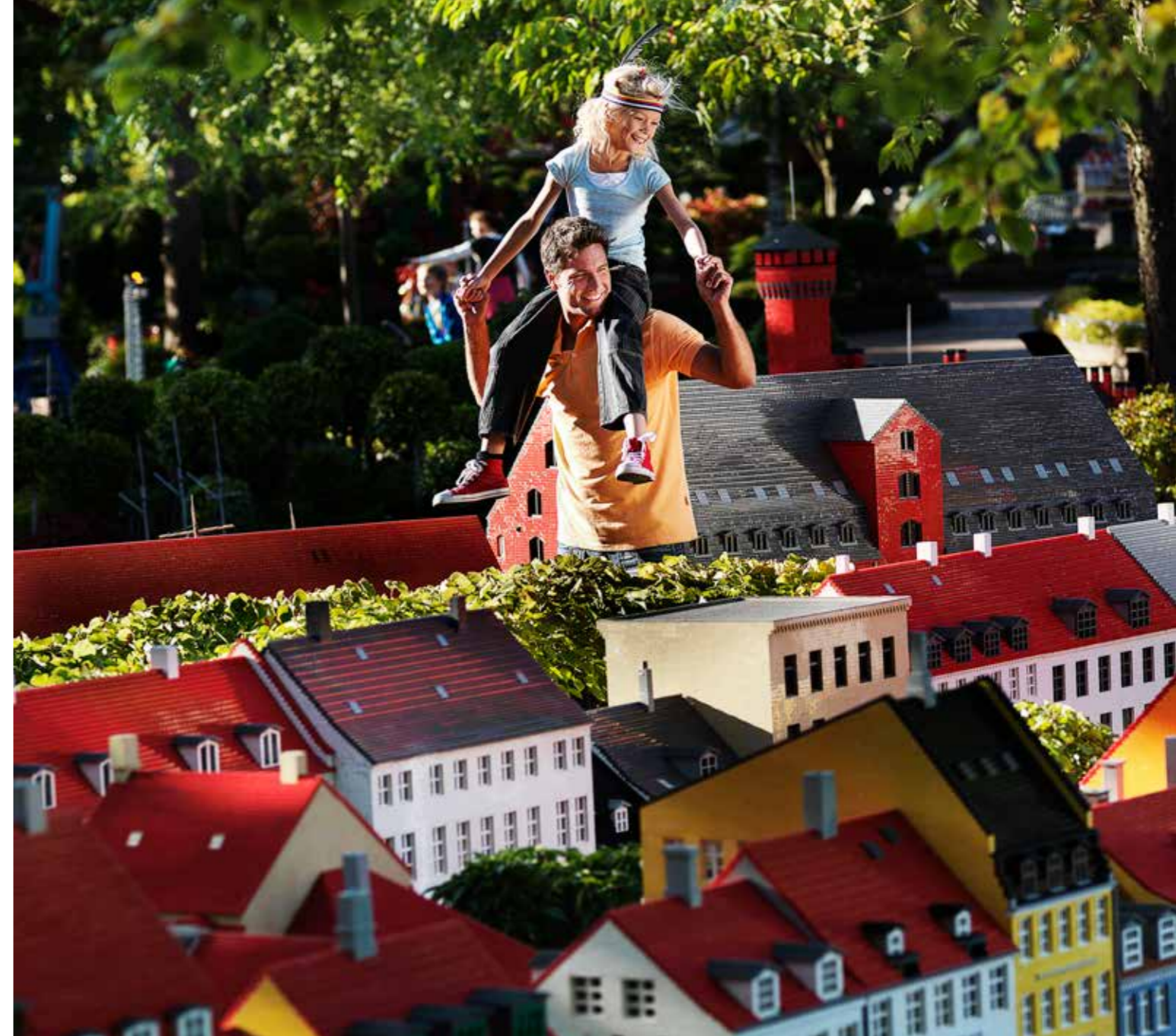
LEGO, the LEGO logo and LEGOLAND are trademarks of the LEGO Group. ©2009, 2015 The LEGO Group.