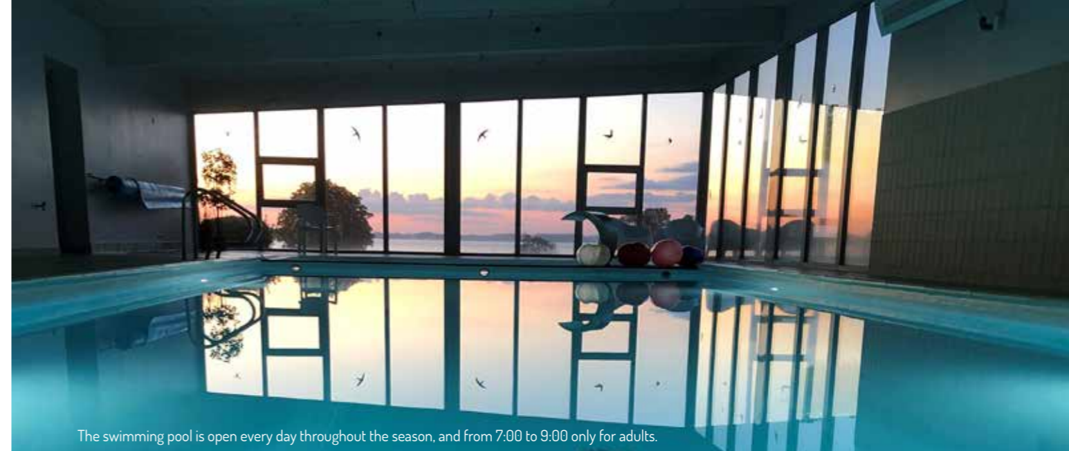
The swimming pool is open every day throughout the season, and from 7:00 to 9:00 only for adults.

Take a look at the full place from above, simply search for "Lærkelunden Camping".